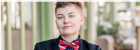
Building Better Lives Across the Gender Spectrum