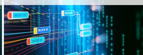
Envisioning Governance Systems that Work