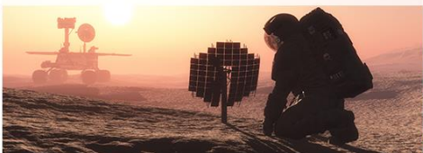
Inhabiting Challenging Environments