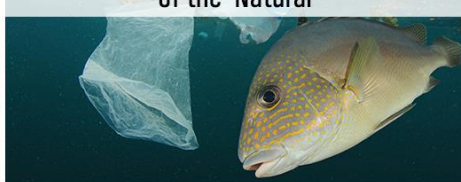
The Pervasive Contamination of the 'Natural'