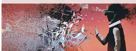
The Arts Transformed