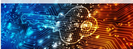
The Changing Nature of Security & Conflict