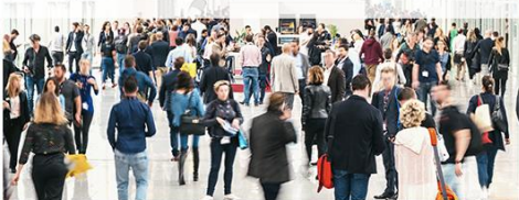
Living Within the Earth's Carrying Capacity