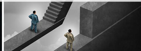
Shifting Dynamics of Privilege & Marginalization