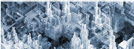
Working in the Digital Economy