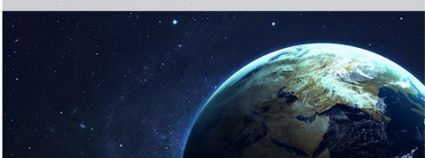
Truth Under Fire in a Post-Fact World