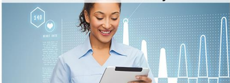
Global Health & Wellness for the 21st Century