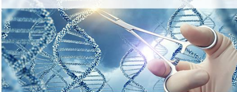
The Evolving Bio Age